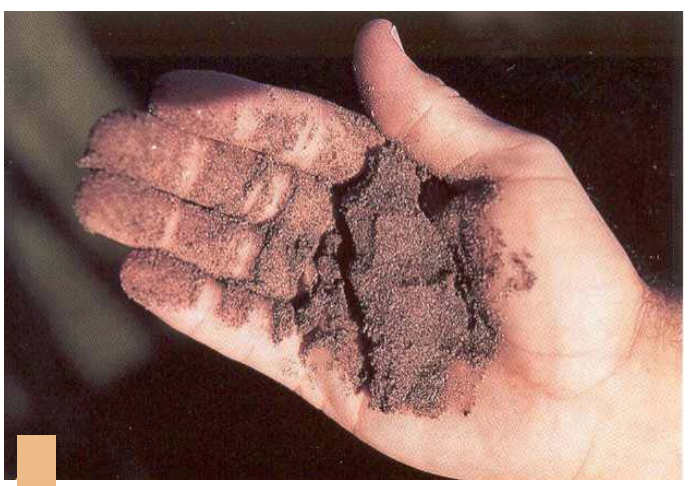
75-100 percent available 0.3-0.0 in./ft. depleted

Moist, forms a weak ball with loose and aggregated sand grains on fingers, darkened color, moderate water staining on fingers, will not ribbon.