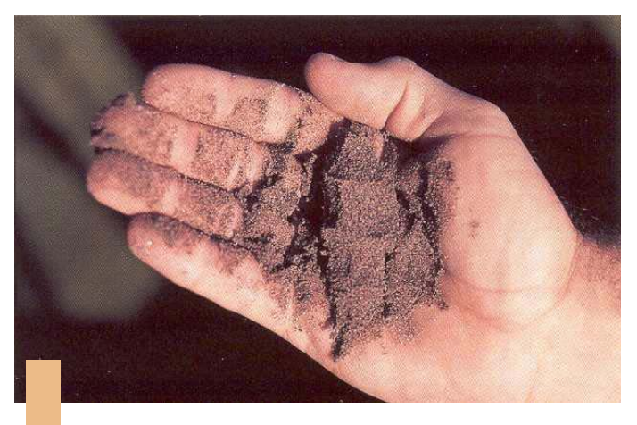
50-75 percent available 0.6-0.2 in./ft. depleted

Slightly moist, forms a very weak ball with welldefined finger mark