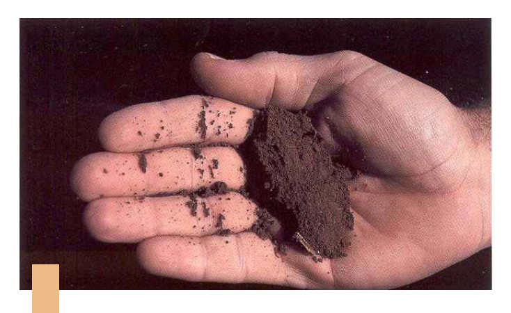
25-50 percent available 1.6-0.8 in./ft. depleted

Dry, soil aggregations break away easily, no staining on fingers, clods crumble with applied pressure. (Not pictured)