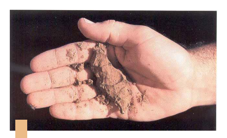
25-50 percent available 1.3-0.7 in/ft. depleted

Dry, forms a very weak ball, aggregated soil grains break away easily from ball. (Not pictured)