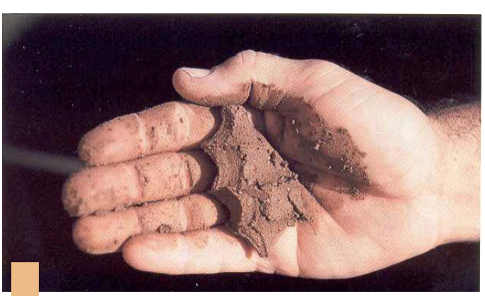
75-100 percent available 0.4-0.0 in./ft. depleted

Moist, forms a ball with defined finger marks, very light soil/water staining on fmgers, darkened color, will not slick.