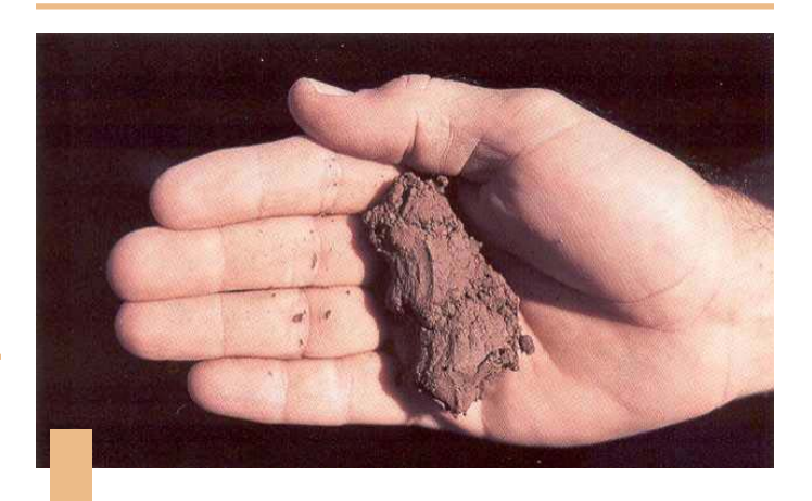
50-75 percent available 1.1-0.4 in./ft. depleted

Slightly moist, forms a weak ball with rough surfaces, no water staining on fingers, few aggregated soil grains break away.