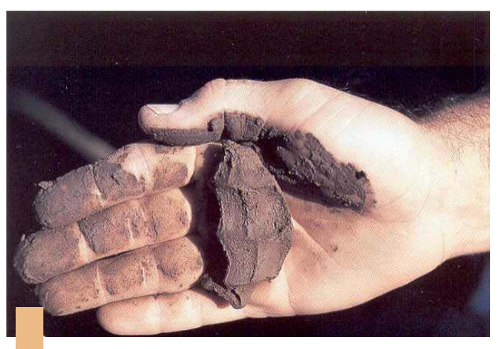
75-100 percent available 0.6-0.0 in./ft. depleted

Moist, forms a smooth ball with defined finger marks, light soil/water staining on fingers, ribbons between thumb and forefinger.