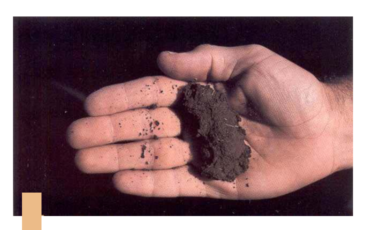
25-50 percent available 1.8-0.8 in/ft. depleted

Dry, soil aggregations separate easily, clods are hard to crumble with applied pressure. (Not pictured)