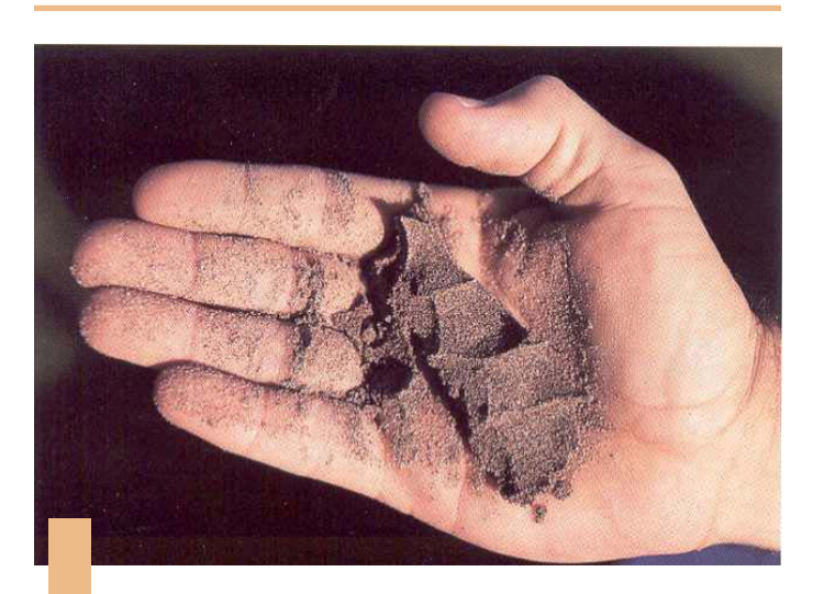
25-50 percent available 0.9-0.3 in./ft. depleted

Dry, loose, will hold together if not disturbed, loose sand grains on fingers with applied pressure. (Not pictured)