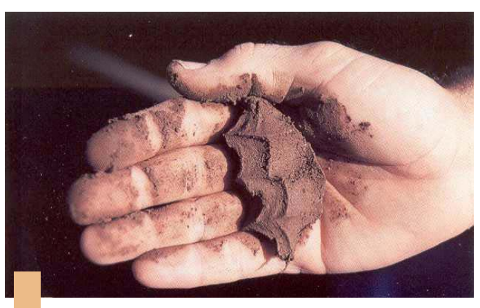
75-100 percent available 0.5-0.0 in/ft. depleted

Moist, forms a ball, very light staining on fingers, darkened color, pliable, forms a weak ribbon between the thumb and forefinger.