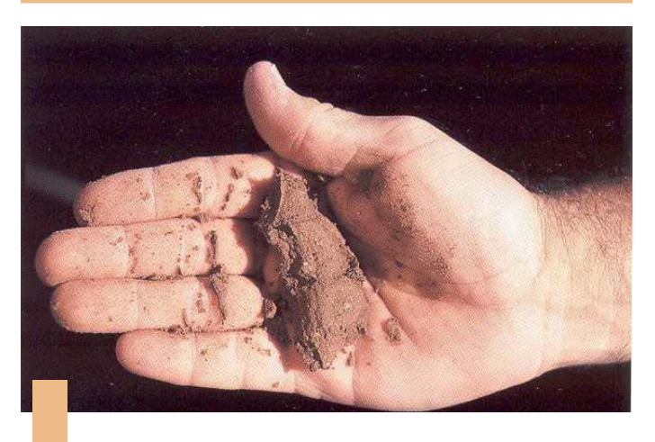
50-75 percent available 0.9-0.3 in./ft. depleted

Slightly moist, forms a weak ball with defined finger marks, darkened color, no water staining on fingers, grains break away.