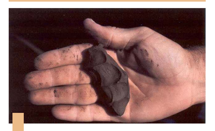
50 - 75 percent available 1.2-0.4 in./ft. depleted

Slightly moist, forms a weak ball, very few soil aggregations break away, no water stains, clods flatten with applied pressure.