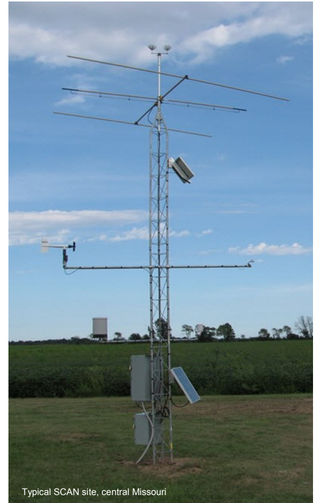
Typical SCAN site, central Missouri

USDA is an equal opportunity provider and employer. NWCC 8/15/2017