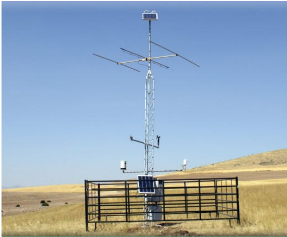
Blue Creek SCAN site, northern Utah.